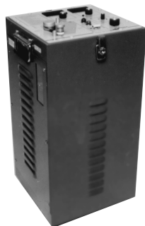
15-kV Portable Model, Cat. No. 651017