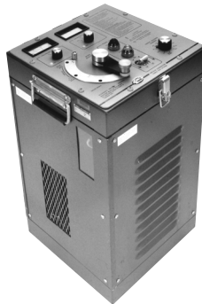
Dual-voltage Model, Cat. No. 651016

This model is designed primarily for direct buried cable in applications that require instrument transport without a truck or van.