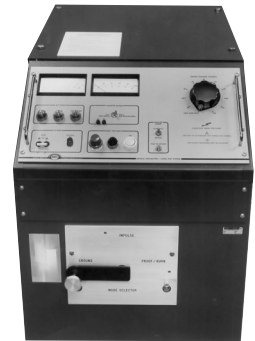
Heavy-duty model, Cat. No. 653031

This model features skids for standard mounting in a van, trailer or truck, and can be optionally caster-mounted for station use.