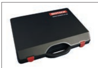
931-22-100 Optional Carrying Case