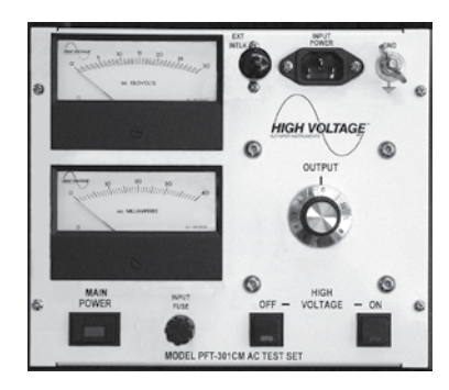
PFT-301CM Control Layout

Note: For 230 volt line input, an F is suffixed to the model number.