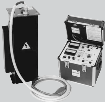
PTS-200 Model (0-200 kVdc, 5mA)