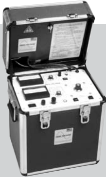
PTS-75 Model (0-75 kVdc, 10mA)

Two HV Portable DC Test Sets for the Price of One!