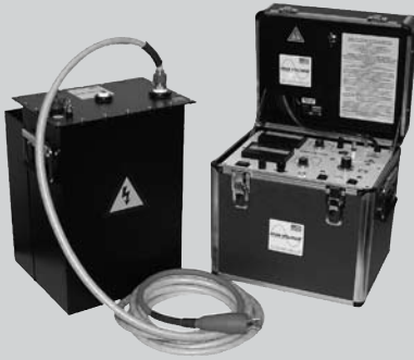
PTS-130 Model (0-130 kVdc, 10mA)