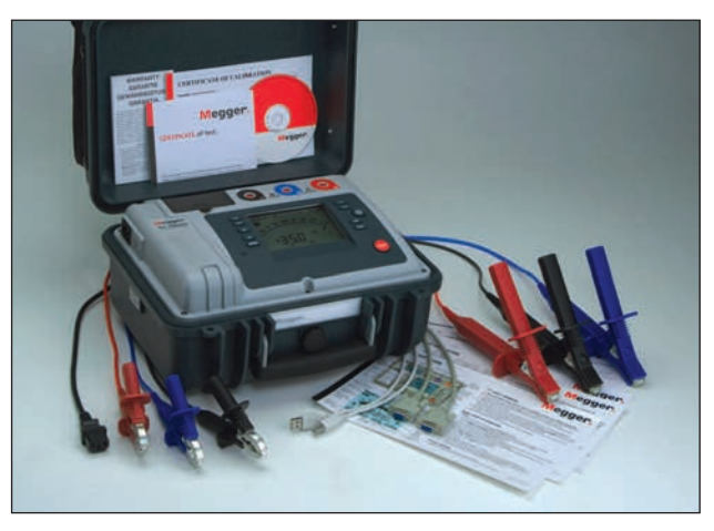
S1-1052/2 shown with included accessories