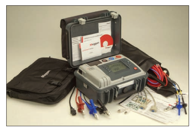
S1-554/2 shown with included accessories