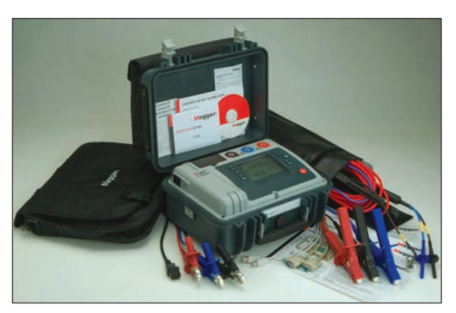
S1-1054/2 shown with included accessories