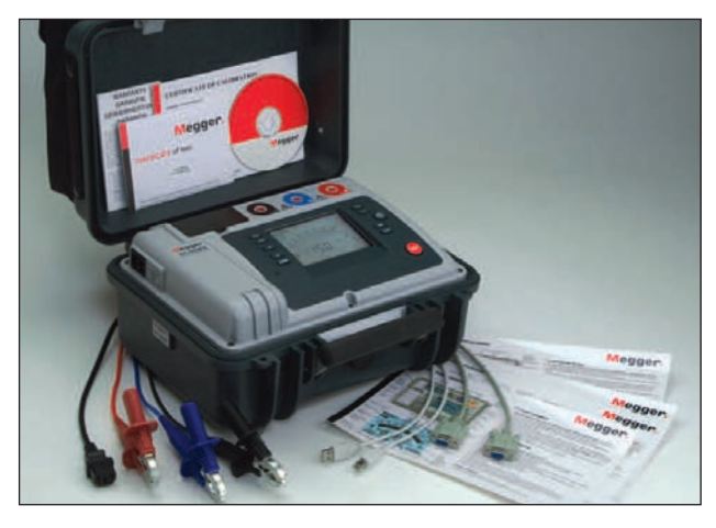
S1-552/2 shown with included accessories