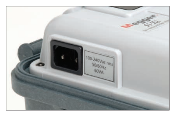
Line or battery operation

It's virtually indestructible, yet ergonomic and lightweight. It features an oversized rubber handle and removable lid for effective use in tight places. A lid mounted lead storage bag is also included.