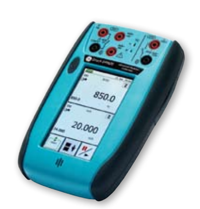
Measure and source mA, mV, V, ohms, frequency, RTD's and thermocouples.

The simple yet sophisticated design and concept combines, for the first time, an advanced electrical calibrator with state-of-the-art pressure measurement and generation, so that there is no longer any need to compromise one measurand capability in favour of another.