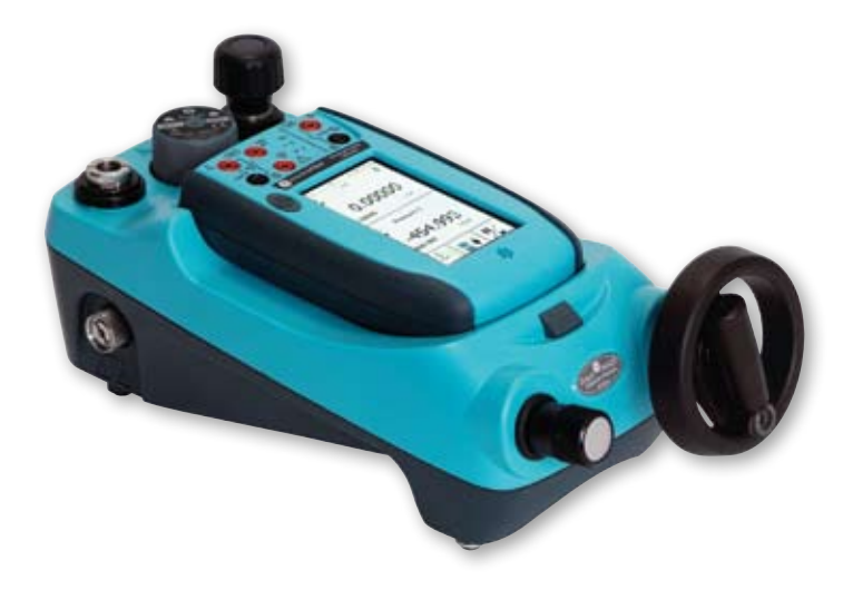
Re-rangeable pressure measurement and generation from 25 mbar (10 inH<sub>2</sub>O) to 1000 bar (15000 psi)