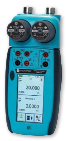
Re-rangeable dual channel pressure measurement from 25 mbar (10 inH<sub>2</sub>O) to 1000 bar (15000 psi)